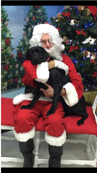
Santa and Scout