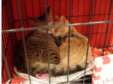
Two of our cats who came out to pose for the special "Love Me Because" event!

To say the Love Me Because adoption event was a success would be a HUGE understatement. We were totally overwhelmed at times with emotion . . . happy emotion that is! Sixteen animals found loving homes, and over $1,600 was raised at this event. A very successful day to say the least!