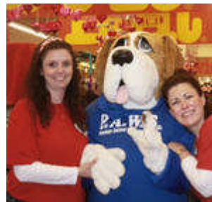
A PAWS event would just not be the same without a personal appearance from Fluffy!

PAWS would like to thank Hood's for welcoming us with our animals, supporting and helping with every aspect of the Love Me Because event. Additionally, we would like to thank the community and the donators of all the wonderful items to raffle and for the silent auction that brought in over $1,600. Thank you, also, to the multitude of adopters and volunteers who helped pull off such a successful event.