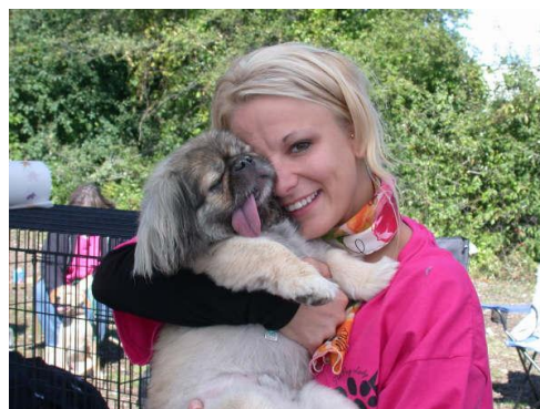
(Volunteer at Walled Lake Expo)