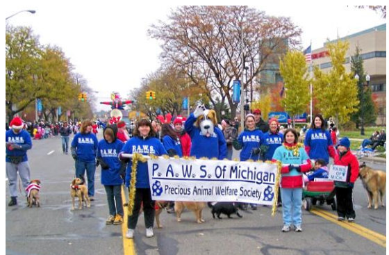
P.A.W.S. volunteers having a great time at the parade

P.A.W.S.' members and their families (including canine members) marched, carrying our brand new P.A.W.S. banner. The parade announcers read a part of our mission statement and talked about the work we do at the Wyandotte pound. It was a cold and rainy day, but marchers had a great time, and we hope to make this an annual event.