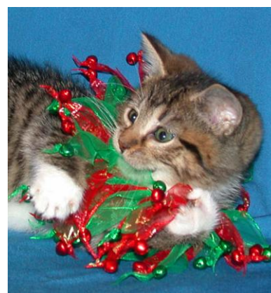
One Of Our Christmas Kitties Waiting For A Home

P.A.W.S. of Michigan P.O. Box 2184 Riverview, Michigan 48193 Email: info@pawsofmichigan.com Website: pawsofmichigan.com