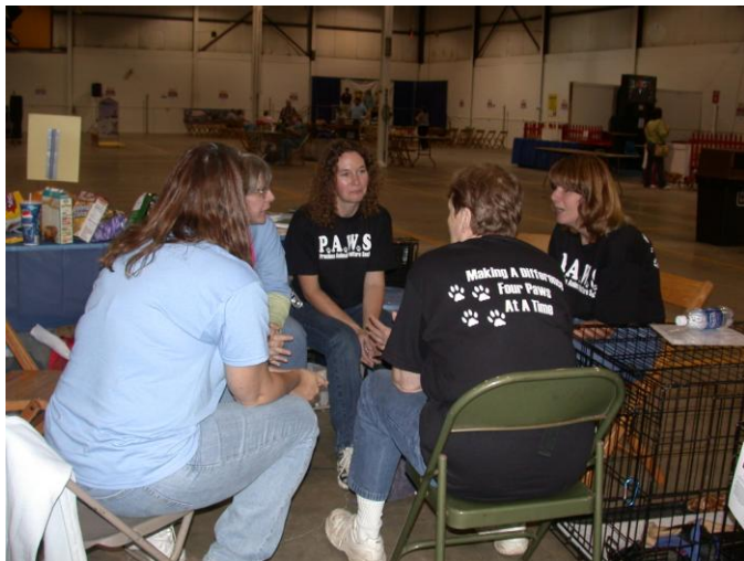
Some of our P.A.W.S. Volunteers at the Howl-O-Ween Event