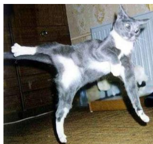
This kitty is jumping for joy – He just heard about “Pennies for P.A.W.S.”

Please take advantage often of these easy ways to help P.A.W.S. earn money, and please pass this email on to everyone in your address book. The more people searching and shopping for P.A.W.S., the more money we make.