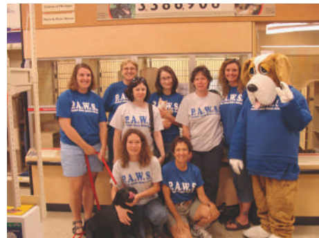
Some of our happy PAWS members at the Canton Store Grand Opening

This store is P.A.W.S. new home base for adoptions. We are fortunate to have the use of the Luv-A-Pet Center, which makes it much easier for people to view our pets for adoption anytime during the week. Adoption events are held weekly at the store on Saturdays from noon until 3:00 p.m. Additional adoptions take place at the Woodhaven PetSmart (West and Allen Roads) on Friday evenings from 6:00 until 8:00 pm.