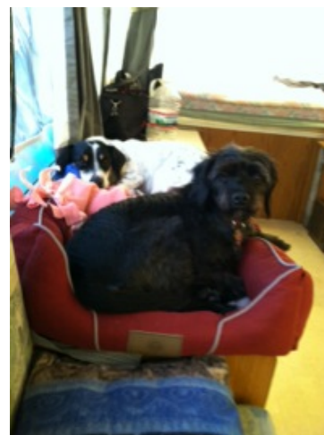
Charlie and Nina