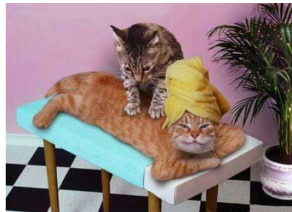
After a long day at the adoption fair – You just need some relaxation time!