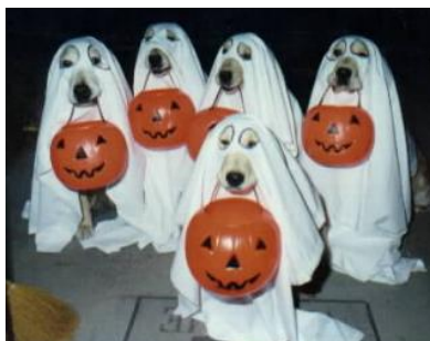
Trick or Treat