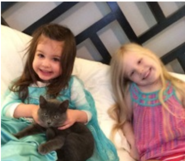
Tank and his “smitten” girls

I took this picture of Artemis just the other day and used it as a picture announcement on facebook to show everyone my pretty kitten =) She has her own little corner kind of area in my sun-room. Of course, she has free roam of my entire apartment (except the bathroom, she recently decided playing in the toilet water and knocking down my make-up was super fun); but in the sun-room she has her litter box, a scratching post, toys, her food dishes, and a small bed if she decides she doesn't want to sleep in my room with me. So this is a pic of her on her scratching post--she seems to like it a lot cause she can lay on top in the warming sun.