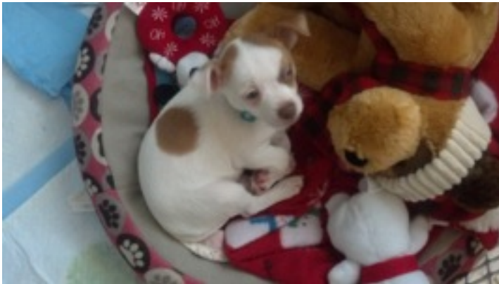
Maya formally known as Chibe